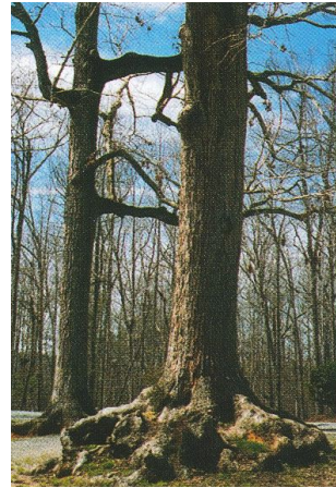
The first old oak tree fell back in May 2000 and we trimmed the second last month.