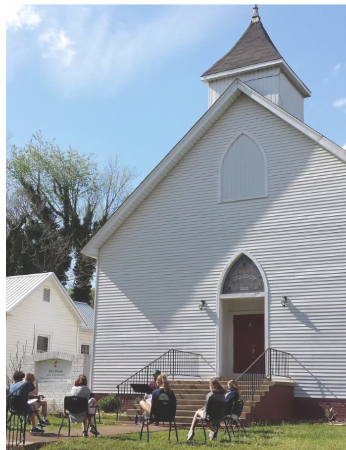
Outdoor Youth Gathering