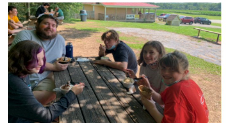
Ice Cream at Maple View Farm with summer camp volunteers