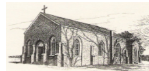
St. Mary's Chapel

St. Mary's Chapel was established in 1759 for the purpose of holding Anglican services in Orange County for the homesteaders who lived in the vicinity of the "Trading Path". The Gothic Revival Style Chapel that now stands was constructed of hand-made brick in 1859. Regular services were discontinued in the 1930's. An annual "Homecoming Day" has been observed for the last 69 years.