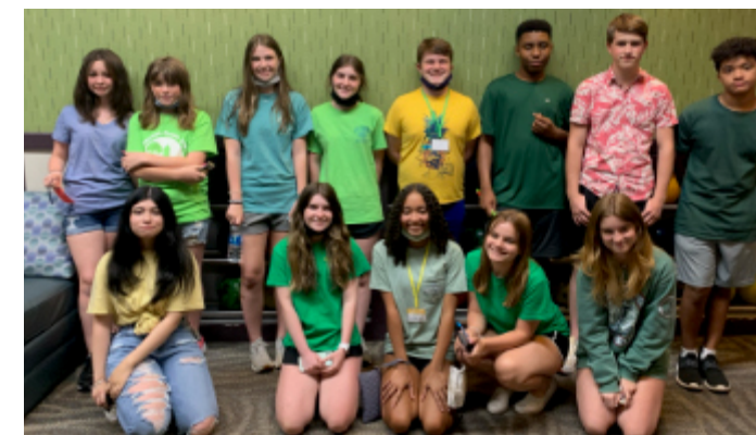
VBS Youth Volunteers bowling