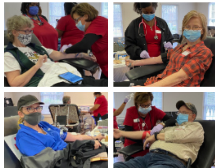
Thank you to the donors and volunteers for the March Blood Drive.