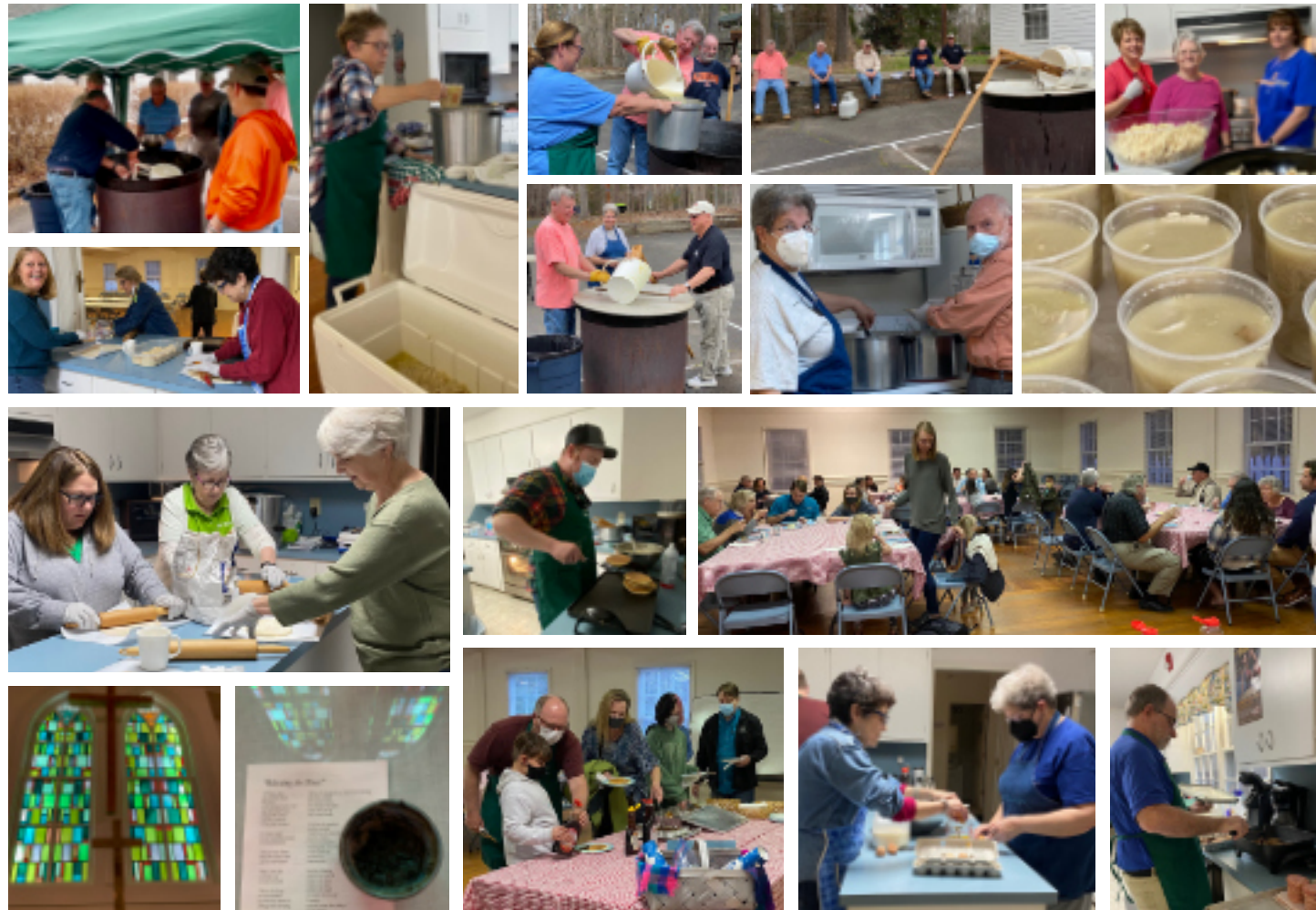
The El Salvador Mission Team appreciates your generosity! The Chicken & Dumplings sale was a success and Pancake Dinner Fundraiser served more than 60 people before Ash Wednesday Service.